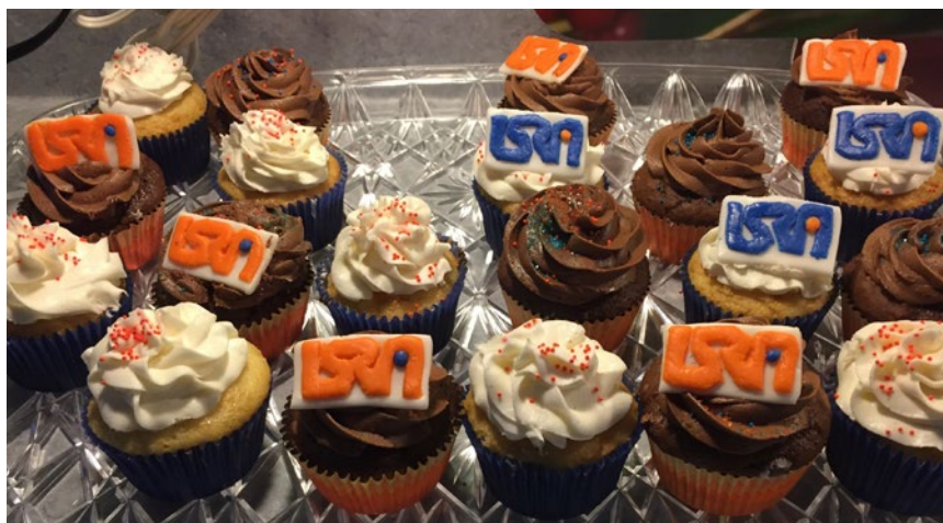
Good & Sweet! (Thanks, Lori!)