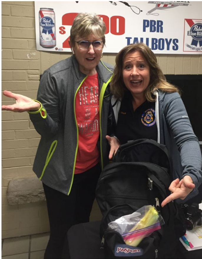
Does this celery look dangerous to you??

http://www.r2sports.com/tourney/viewResults.asp?TID=20296