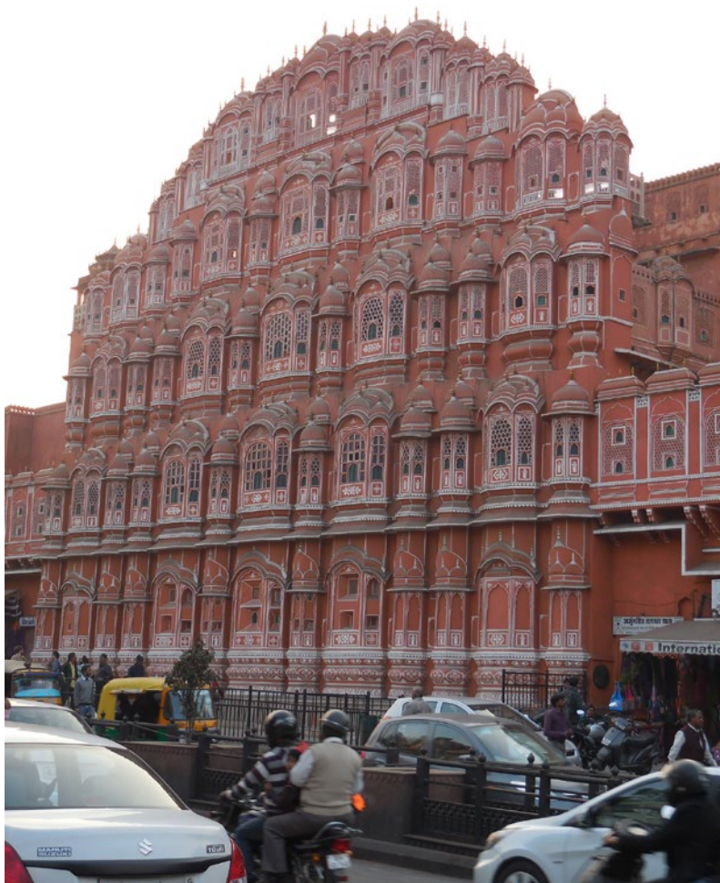
Jaipur, India -- The Pink City