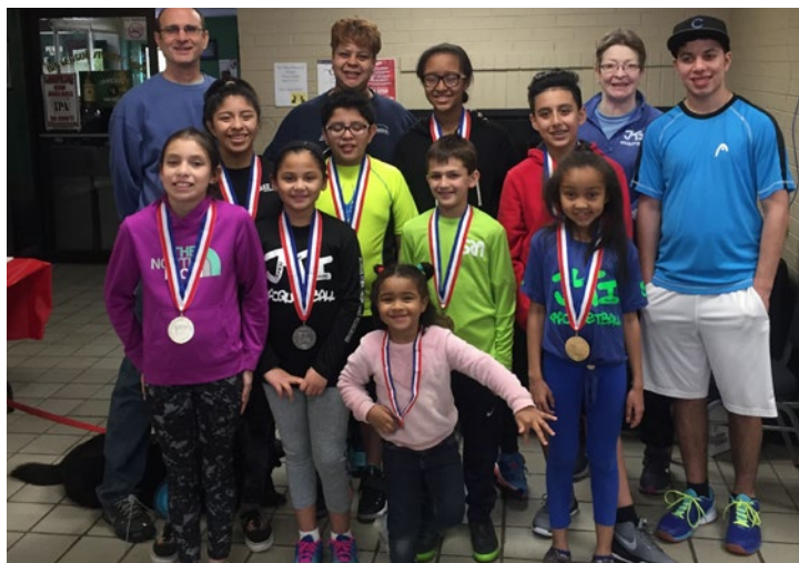
ISRA State Singles -- April 2017