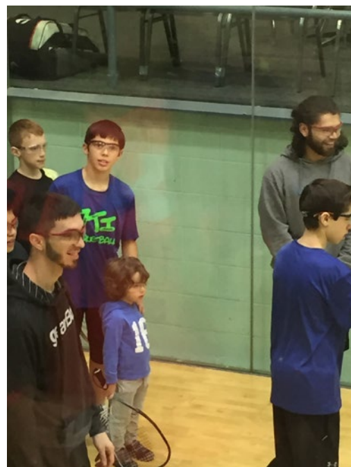
Shamrock Junior Clinic -- familiar faces!