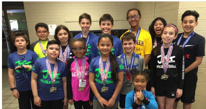
USAR Regionals -- April 2017

USAR Regionals was the last day of the scheduled JTI season, and once players were finished competing and medals were awarded, a pizza-and-cake celebration concluded the season.