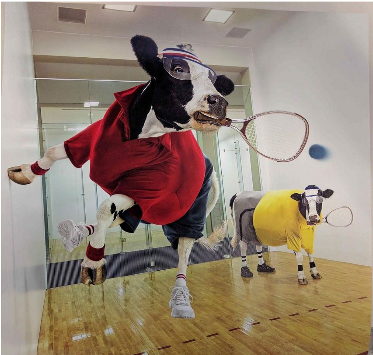
Photo Credit -- From the Internet: artist appreciated but unknown!