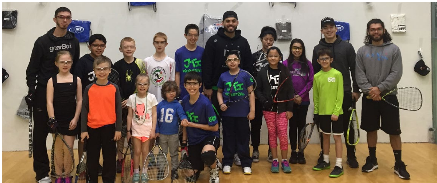
Junior Clinic with the Pros!